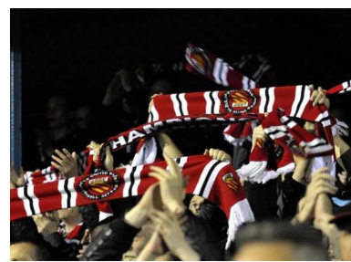
FC United of Manchester. Fans and Football United.